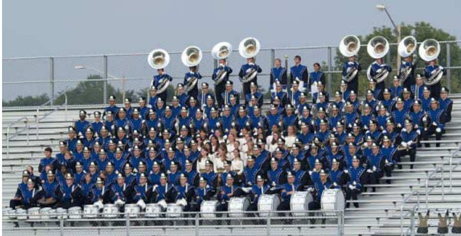
Robinson Band 2007

The members of the All Night Grad Party Planning Committee would like to send a sincere and heartfelt "Thank You!" to all who helped with this year's Craft Fair at Robinson! The All night Grad Party is a safe, fun event for our graduating seniors the night of their graduation and we are thankful to the Robinson community for supporting this! We appreciate all the efforts of our volunteers--everyone from the students and parents who helped with set up and clean up, to the people who staffed the Craft Fair on both days, to those who baked all the scrumptious goodies for the bake sale--and everyone else in between! Thank you for your generous response to our needs and for your over-the top helpfulness! The success of the Craft Fair depended on you and you made it happen! Thank you! See 2008 ANGP website at www.ramsangp2008.com .