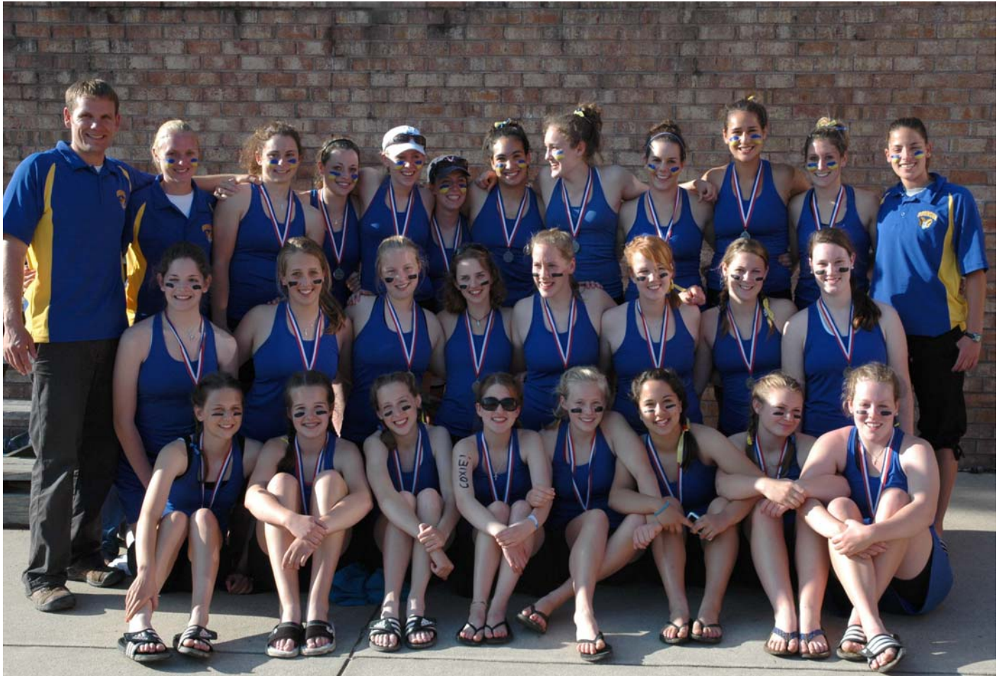
2008 Virginia State Championship Medal Winners

Congratulations Robinson Crew on your success at: